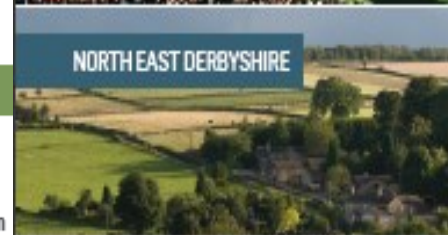
NORTH EAST DERBYSHIRE