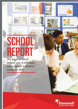
Stonewall School Report

Setting up an LGBT group might seem a bit daunting but our suite of resources will help you every step of the way.