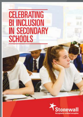
Stonewall Bi Inclusion Guide