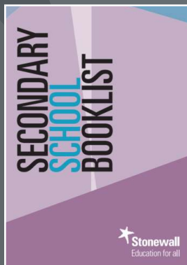
Secondary School Book List

If you'd like to order any of these support materials please email education@stonewall.org.uk