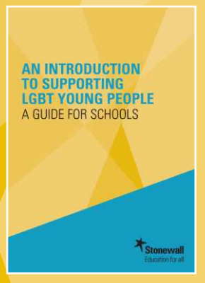
An Introduction to Supporting LGBT Young People