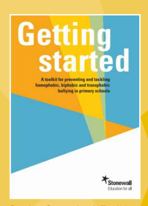
Getting Started – A Toolkit for Primary Schools