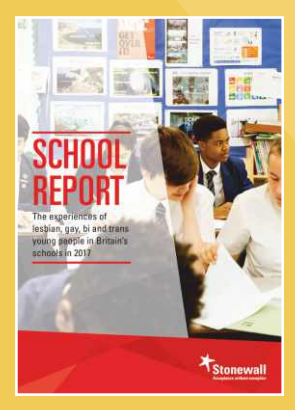
Stonewall School Report

Introducing diversity into your school council might seem a bit daunting but you're not on your own. We've a whole suite of resources to help you everystep of the way. These include: