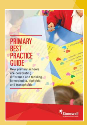
Primary Best Practice Guide