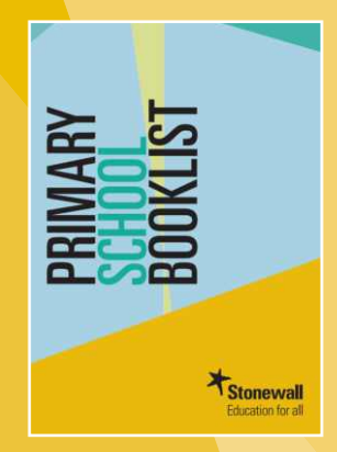
Primary School Book List

If have any questions, please get in touch by email at education@stonewall.org.uk