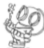
Stage 3 Characters