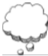
Stage 1 Generate ideas

IC practitioners work with children and young people ages 4-14, from Early Years to Key Stage 3.