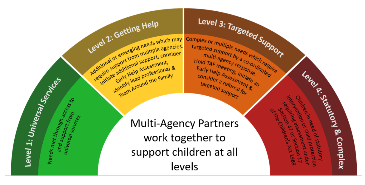
Level 1: Universal Services

Your next steps will depend on the level of need of the child/family.